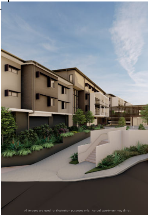
All images are used for illustration purposes only. Actual apartment may differ.